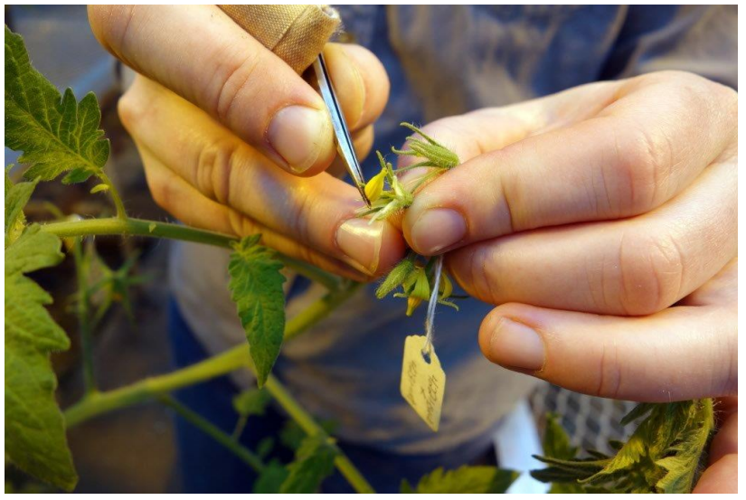
Figure 2. Manual pollination of tomato flowers